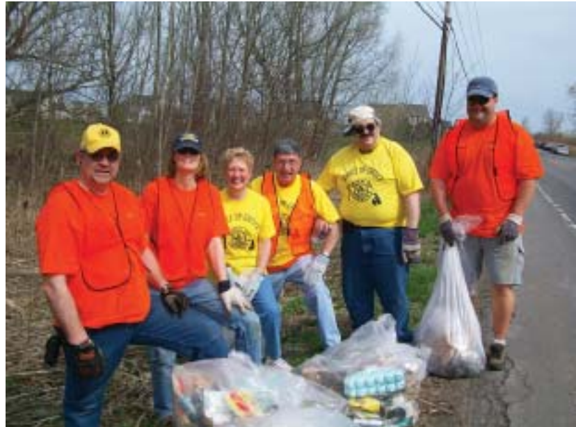
Greece Ridge Lions participating in the Town of Greece "Spruce Up Greece."

The Batavia Lions Club approved funding for an eye exam and possible glasses for a first grade student in Elba school.