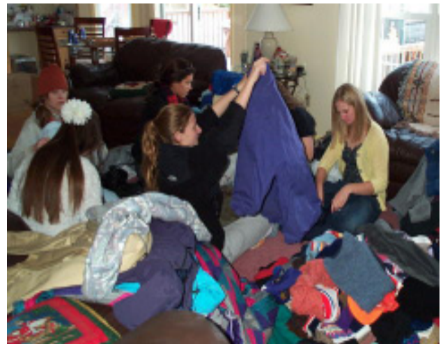
Penfield Leos Sorting Clothing